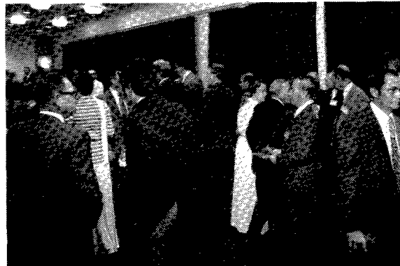
Meeting participants socialize at the cocktail hour preceding the banquet