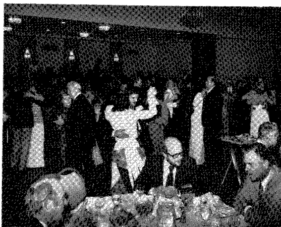
Dancing at the banquet